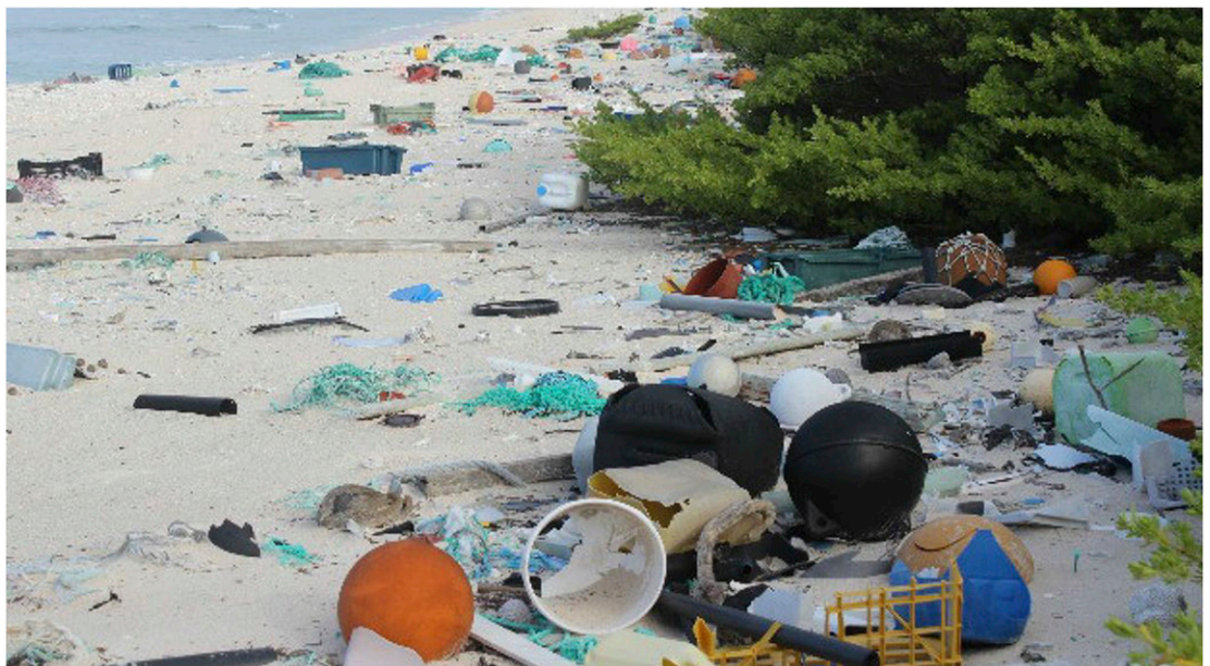
Plastics are accumulating across the globe at an astounding pace, even in remote places like the one pictured here—the uninhabited Henderson Island in the South Pacific. The time is ripe for an international agreement with measurable reduction targets to lessen the plastic pollution in the world's oceans. Reprinted with permission from ref. 19.

An estimated 4.4–12.7 million metric tons of plastic are added to the oceans annually (3). Like many other contaminants (such as greenhouse gases and ozone-depleting substances), plastic is not constrained by national boundaries, because it migrates via water and air currents and settles in benthic sediments. More than 50% of the ocean's area sits beyond national jurisdiction, including the